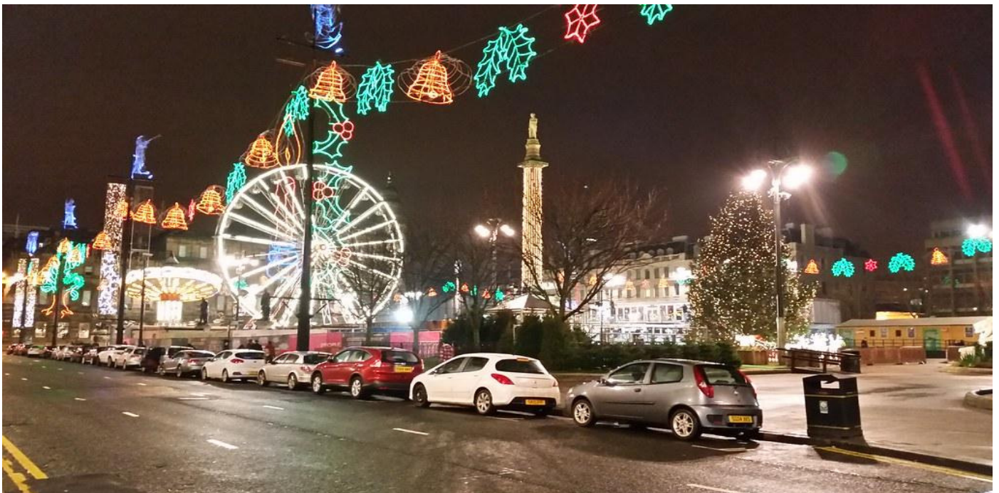
"Giant Wheel" by Michel Curi is licensed under CC BY 2.0