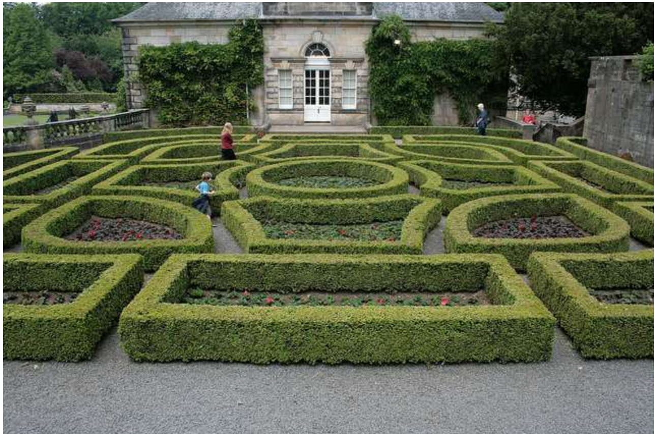
Garden maze at Pollock house and gardens, taken June 2010. http://bit.ly/2oeZD7X