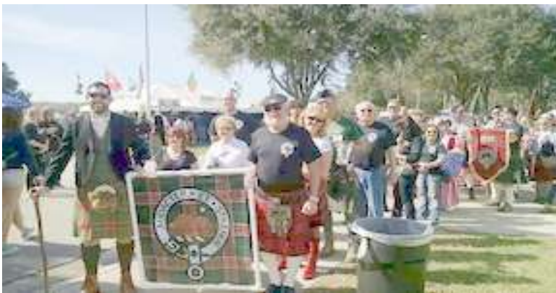
Brent leading the parade of Pollocks