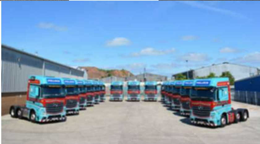
What an advertisement for Pollock! Frazier Pollock's fleet of trucks in West Lothian, Scotland