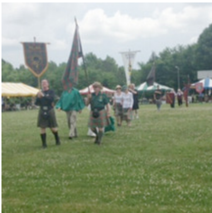
Marching on the field at the Glasgow Games