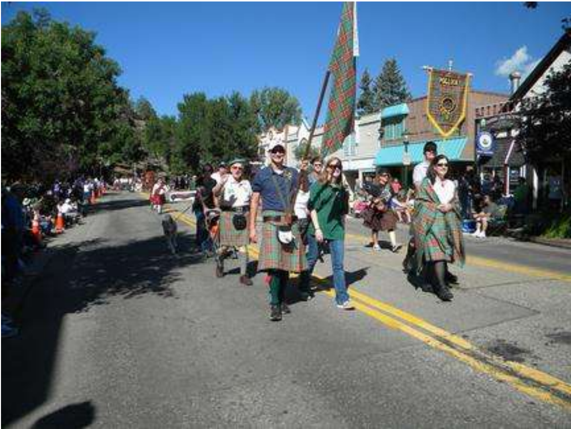
POLLOCKS ON PARADE IN ESTES PARK