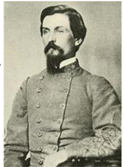
From: The Photographic History of The Civil War in Ten Volumes: Volume Five, Forts and Artillery. The Review of Reviews Co., New York. 1911. p. 73. http://commons.wikimedia.org/wiki/File:WilliamTPoague.jpg