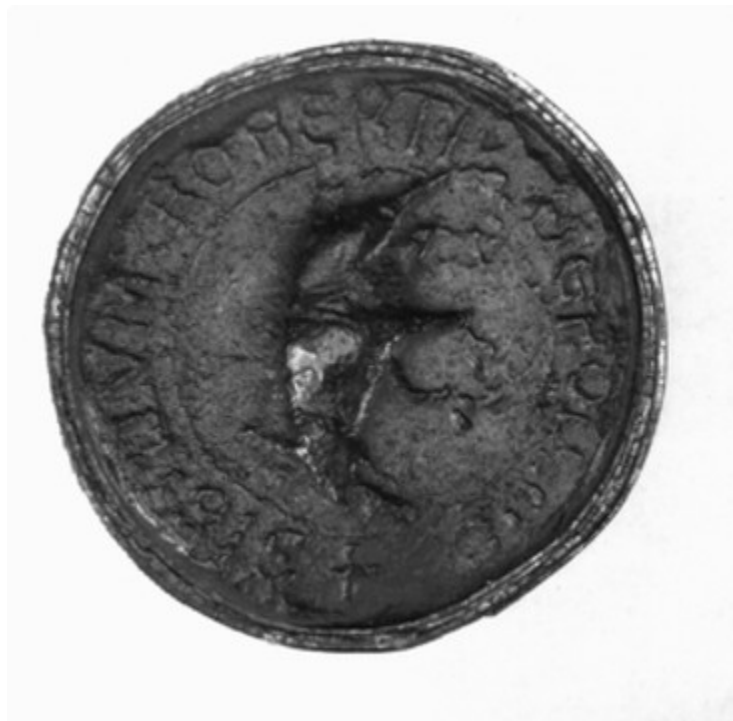
Seal of Robert de Polloc