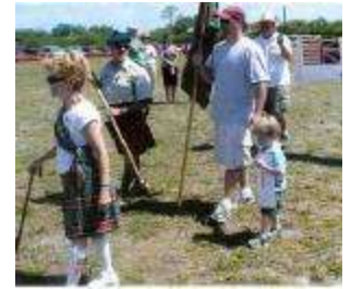
Pollocks on Parade

If there isn't a Clan Pollock Tent at a game you are attending remember to look for a Clan Maxwell tent. We are a sept of Clan Maxwell.